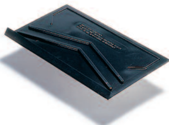
Underlay opening protector