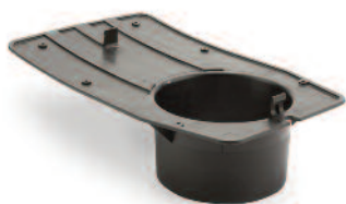
Glidevale GV110 pipe adaptor